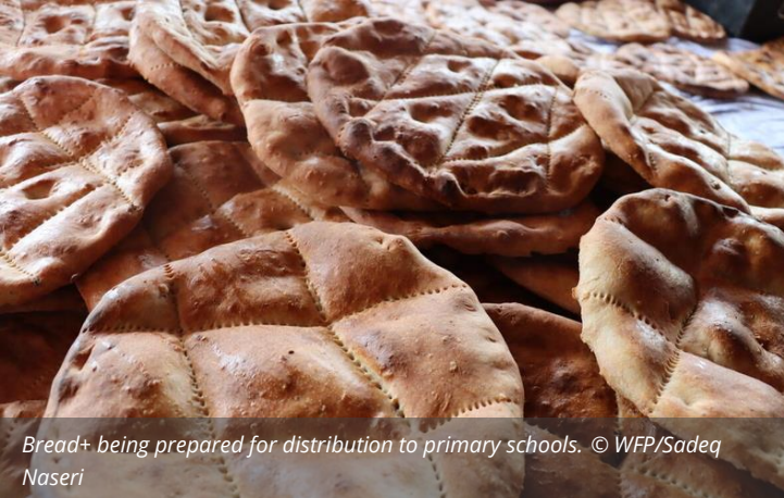
Bread+ being prepared for distribution to primary schools.