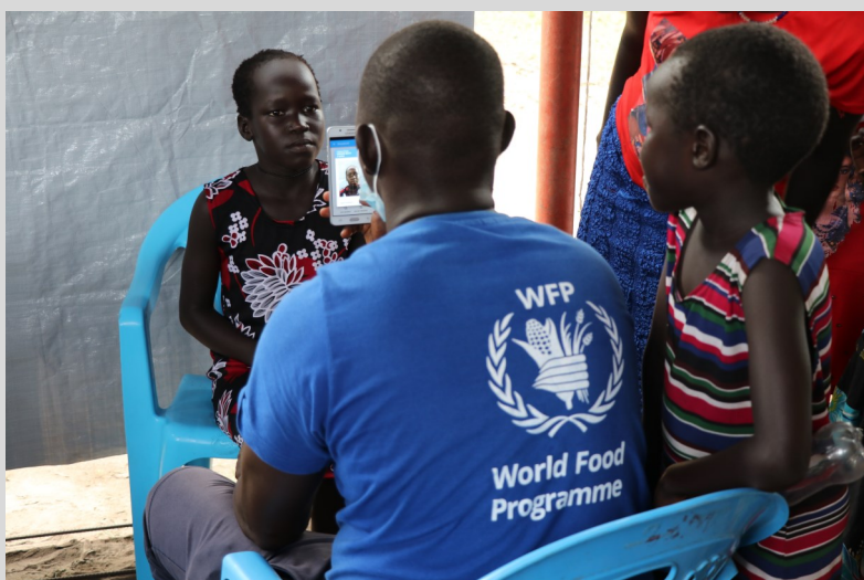
Photo: Biometric registrations are ongoing in Ayod Town

Following reports received from local authorities that around 30,000 people had recently arrived to Ayod town displaced by the floods, WFP deployed a Rapid Response Mechanism (RRM) team to quantify how many people are in need of assistance. The team is still on the ground conducting the SCOPE registration and WFP is ready to distribute food assistance to those in need. Nutrition supplies have already been provided to children under five.