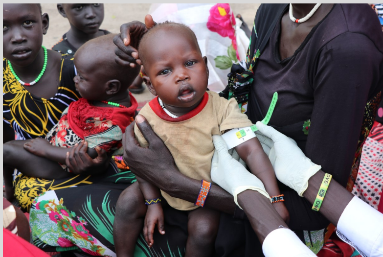
Photo: MUAC (Mid-Upper Arm Circumference) nutrition assessment measurements (WFP/ Eulalia Berlanga)