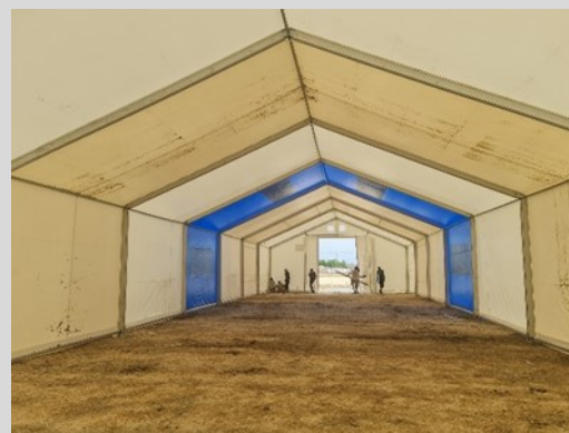
New MSU's installed at ABSS compound in Renk