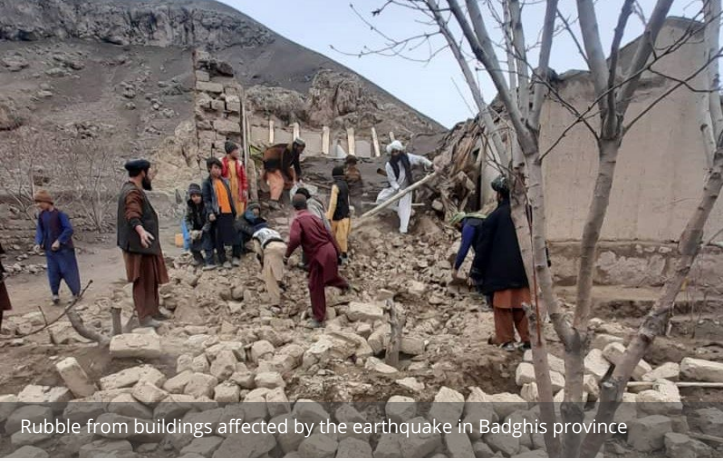
Rubble from buildings affected by the earthquake in Badghis province