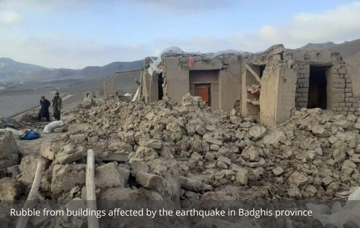
Rubble from buildings affected by the earthquake in Badghis province