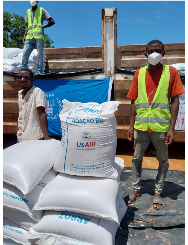
Photo: WFP emergency food distribution in in Erati district, Nampula on 25 February.