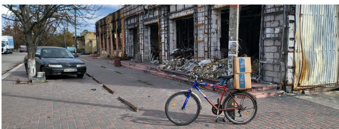
Lyman, a strategic town in Donetsk oblast which only became accessible in October since spring, remains heavily damaged with non-functional markets, in need of humanitarian food assistance.

WFP dedicated convoys continue to deliver food baskets in the newly accessible areas; in the past two weeks, three dedicated convoys on 12, 14, and 16 October delivered food baskets to more than 9,400 beneficiaries in Lyman, Kupiansk, and Marhanets respectively.