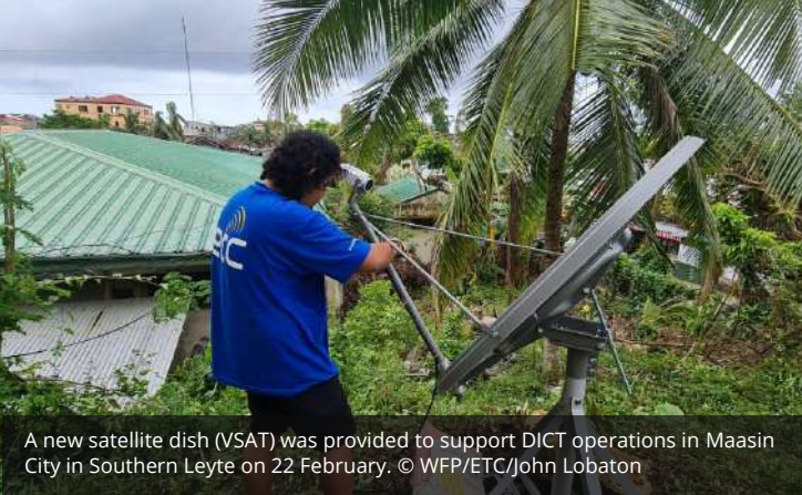
A new satellite dish (VSAT) was provided to support DICT operations in Maasin City in Southern Leyte on 22 February.