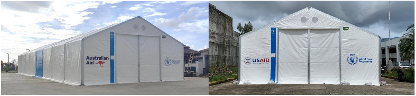
Through the generosity of USAID and Australia's Department of Foreign Affairs and Trade, WFP has established two emergency logistics hubs in Siargao Island and Surigao City. The hubs have been turned over to the Philippine Government and are currently supporting storage and warehousing needs for the Typhoon Odette response.

island province. Meanwhile, food distributions in neighbouring Siargao, in the province of Surigao del Norte, will commence this week, targeting 65,000 people. In both locations, WFP is currently working with third-party monitors for distribution monitoring.