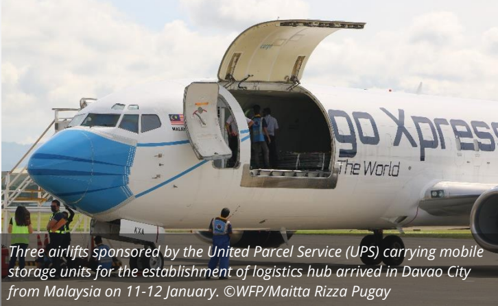
Three airlifts sponsored by the United Parcel Service (UPS) carrying mobile storage units for the establishment of logistics hub arrived in Davao City from Malaysia on 11-12 January.