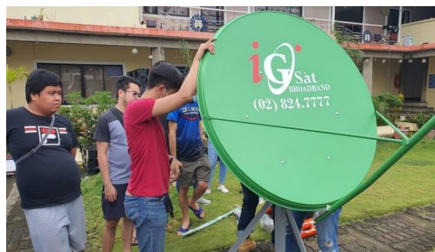
Photo: WFP assists the Department of Information and Communications Technology in the pre-configuration and test setup of three new Very Small Aperture Terminals (VSAT). ©WFP/John Lobaton