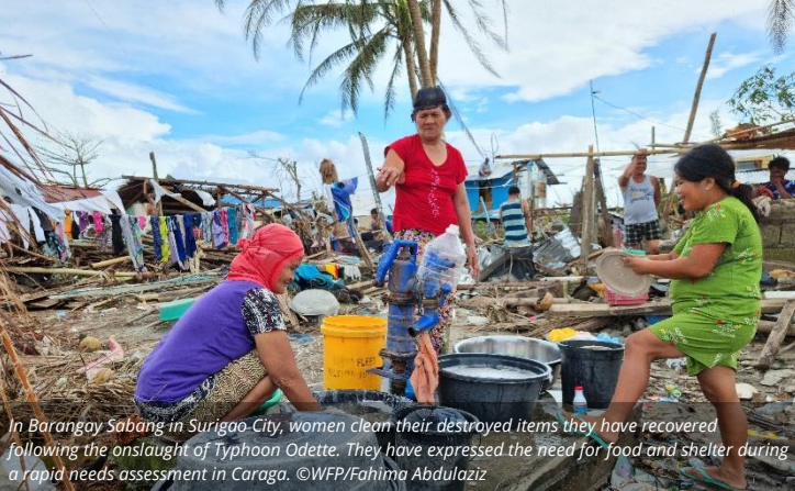
In Barangay Sabang in Surigao City, women clean their destroyed items they have recovered following the onslaught of Typhoon Odette. They have expressed the need for food and shelter during a rapid needs assessment in Caraga.