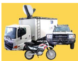
MOVE sets are rapidly deployable emergency communication devices integrated into custom vehicles that enable ICT-enabled support to disaster-stricken areas. MOVE is unique to the Philippines; the global prototype having been co-built and co-designed by DICT and WFP emergency telecommunications experts over the last year. These were used for the first time in response to the impact of Typhoon Odette.

Very Small Aperture Terminals (VSAT) are currently positioned in strategic locations and are either operational or undergoing installation. WFP supported DICT with the configuration and test setup of these telecommunication devices. In Surigao City, WFP assisted with the configuration of equipment to provide connection for the Philippine Navy Operations Centre at the seaport.