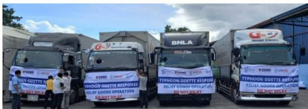
Photo: WFP is providing transport support to the Government's response with the delivery of emergency relief items to affected areas.

family food packs , as well as other relief items such as hygiene kits, sleeping kits, and family kits. Relief items are being delivered to the worst-hit areas including Surigao City, Cebu City, Bohol, Iloilo City, Dumaguete City, Himamaylan City, and Southern Leyte; and to airports in Clark, Pampanga and Mactan, Cebu. Through a collaboration with the Philippine Disaster and Relief Foundation, relief items were also transported via barge from Butuan City to Palawan.