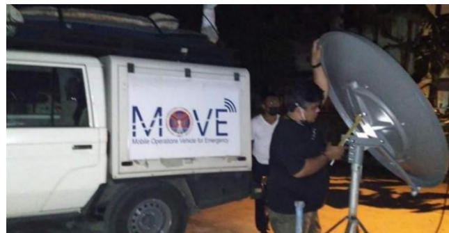
Photo: WFP helps re-establish communications networks in Surigao City.