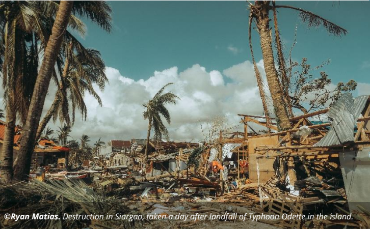
Destruction in Siargao, taken a day after landfall of Typhoon Odette in the island.