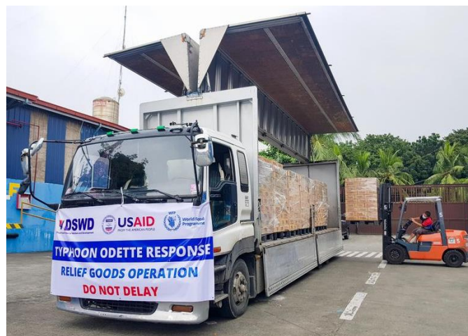
Photo: WFP, through the support of USAID, assists DSWD with the transportation of 10,000 family food packs destined for Butuan City.