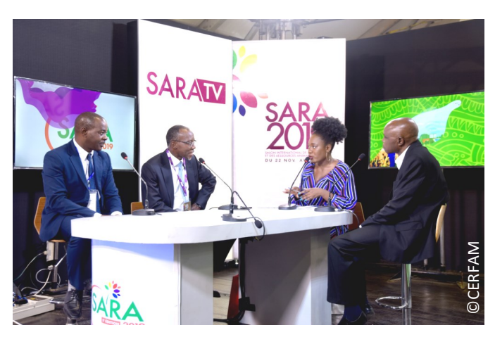
The various partners and actors involved in the research and implementation of innovative technologies, took advantage of a workshop organized in Abidjan by CERFAM, to visit the International Exhibition of Agriculture and Animal Resources of Abidjan (SARA 2019). They've discovered there productions, innovations and direct investment opportunities in the agricultural, animal, fishery and forestry sector of Cote d'Ivoire and the countries of the sub-region. The workshop was organized in collaboration with the government of Cote d'Ivoire and other partners, on the theme "Investing in good practices and innovative technologies to reduce post-harvest losses and help improve food security and nutrition". The workshop, which was held on 23 and 24 November 2019 , aimed to encourage discussions and the sharing of experiences between different actors in the agricultural sector.