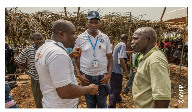
Discussions focused on sharing agricultural experiences, approaches and innovations

From October 28 to November 1, 2019, the German Agency for International Cooperation (GIZ) organized the Sector Network for Rural Development (SNRD) conference in Abidjan.