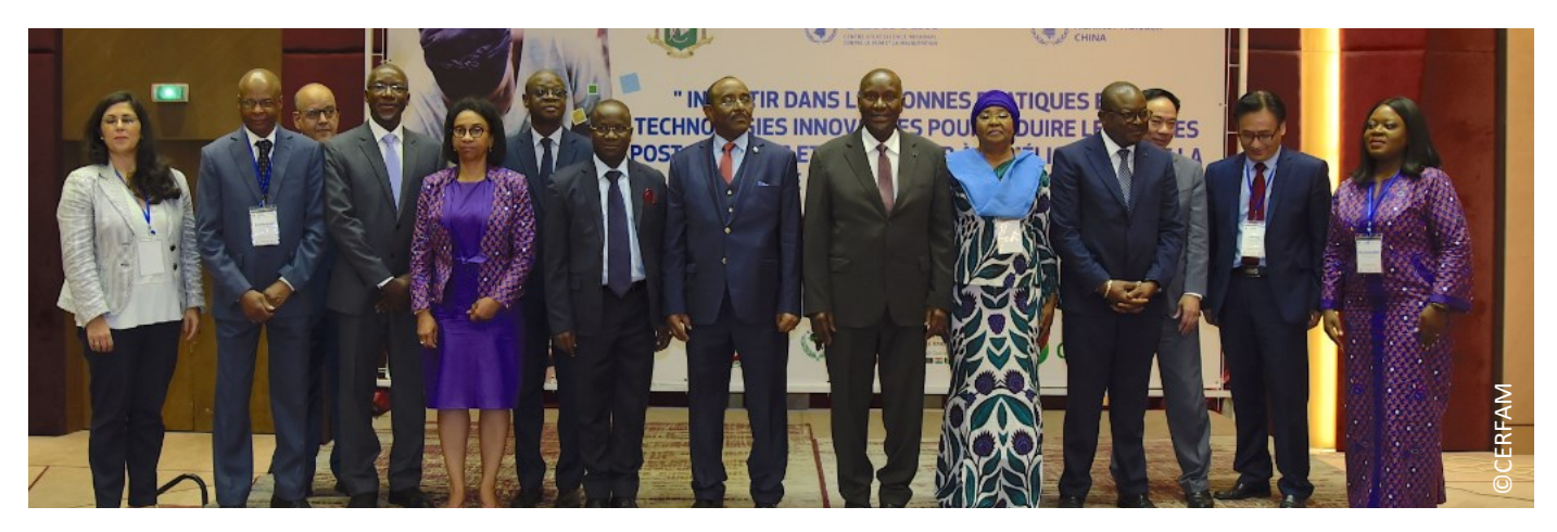
CERFAM brought together political authorities and more than 70 experts during the workshop on the fight against post-harvest losses in Africa

From cereals to vegetables, tubers and fruits, post-harvest losses represent a major issue in Africa and are estimated at 37% of the total production. At which stages do these losses occur? What are the solutions to address these challenges? These are some of the questions that CERFAM and its partners tried to address during a workshop held in Abidjan on 23rd and 24th November on the theme "Investing in good practices and innovative technologies to reduce post-harvest losses and help improve food security and nutrition. "