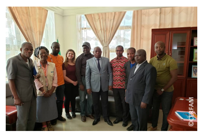
As a prelude to a capacity building mission for Congolese producers in cassava processing ( 11 Nov to 16 Dec ), a delegation of experts from the Ministry of Agriculture of Cote d'Ivoire, led by CERFAM, carried out a preparatory mission to identify needs and logistics. In the picture, the family photo of the Ivorian delegation and CERFAM with the Congolese Minister of Agriculture.