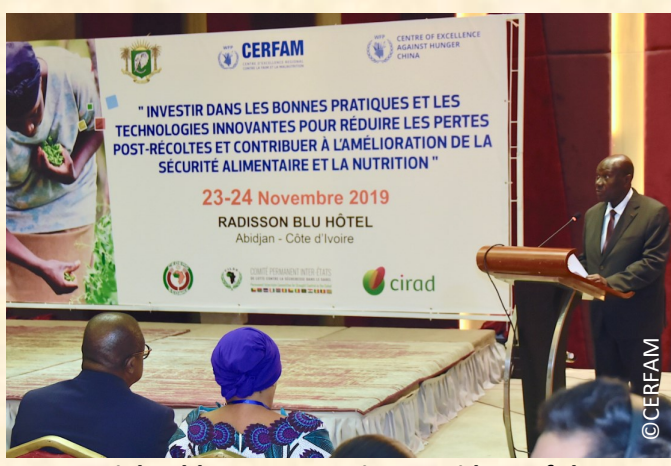
Daniel Kablan Duncan, vice-president of the Republic of Côte d'Ivoire:

"... In Côte d'Ivoire, data indicate a reduction in the prevalence of moderate food insecurity to 10.8% in 2018 and the elimination of the severe form of food insecurity, the reduction in the prevalence of stunting in children under 5 from 29.8% in 2012 to 21.6% in 2016. I reiterate Côte d'Ivoire's commitment to fight hunger and malnutrition in collaboration with the countries of the region, in order to make progress towards the implementation of the Malabo Declaration of the African Union by 2025 and the 2030 Agenda of the United Nations related to the Sustainable Development Goals (SDGs)".