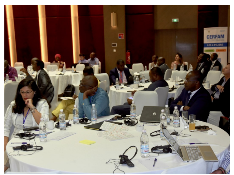
For experts presents at the workshop, Africa is full of endogenous good practices and expertise related to post-harvest losses management and agriculture which should be better recognized, scaled up and shared.

6 . Governments, regional institutions and partners would benefit from investing in initiatives aimed at filling the gap in data collection and developing reliable methodologies and tools to identify constraints and bottlenecks related to assessment of qualitative and quantitative losses, and their