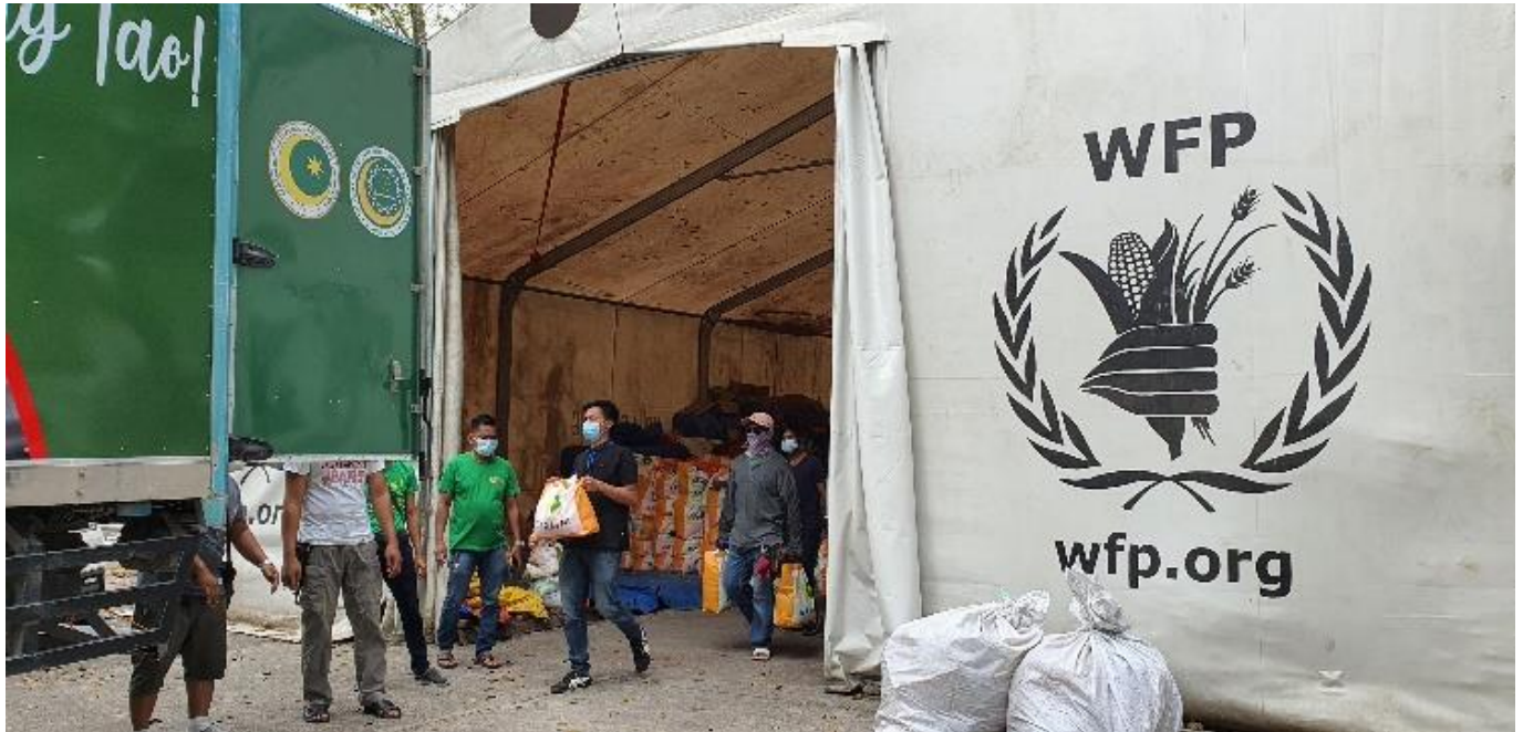
WFP's mobile storage units, which were loaned to the BARMM Government for their storage and warehousing requirements in their COVID-19 response, are currently used to store relief items for the armed conflict response.