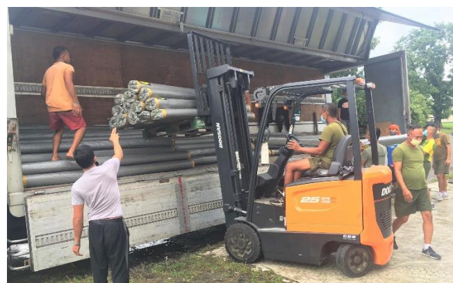
Bound for Camarines Sur and Catanduanes, these essential non-food items are being transported by WFP for the Typhoon Rolly response in support of the Office of Civil Defense and the AHA Centre/Disaster Emergency Logistics System for ASEAN.