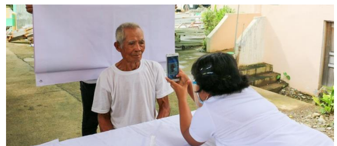
WFP and the local government of San Miguel, Catanduanes have created a special lane for senior citizens, persons with disabilities, and other vulnerable populations during beneficiary registration.