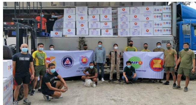
WFP transported non-food essential items to the Province of Marinduque. This is for the ongoing Typhoon Rolly disaster response in Southern Luzon, led by the Office of Civil Defense and ASEAN Coordinating Centre for Humanitarian Assistance on disaster management (AHA Centre)/Disaster Emergency Logistics System for ASEAN.