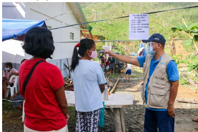
Health and safety protocols were also implemented in the registration sites, including taking of temperature of beneficiaries. WFP has also posted COVID-19 preventive measure banners at registration sites.