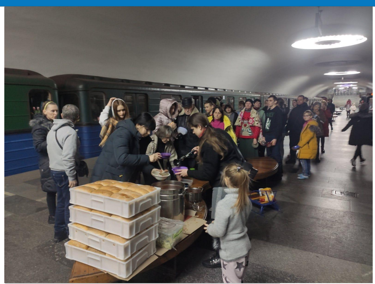
Photo Caption: WFP Bread Distribution through partners in a Kharkiv metro subway station, Ukraine.

A Telecommunications Specialist from WFP's Fast IT and Telecommunications Emergency Support Team (FITTEST) is programming a radio repeater at the warehouse in Rzeszow and preparing it to be deployed in Lviv to establish a back-up security communications system for humanitarians in the city.