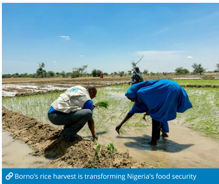
🔗 Borno's rice harvest is transforming Nigeria's food security

In 2025, WFP Nigeria's Country Strategic Plan 2023-2027 was supported by AfDB, Canada, ECHO, France, Germany, Republic of Korea, Saudi Arabia, Sweden, UN CERF, United Kingdom, United States, and private donors.