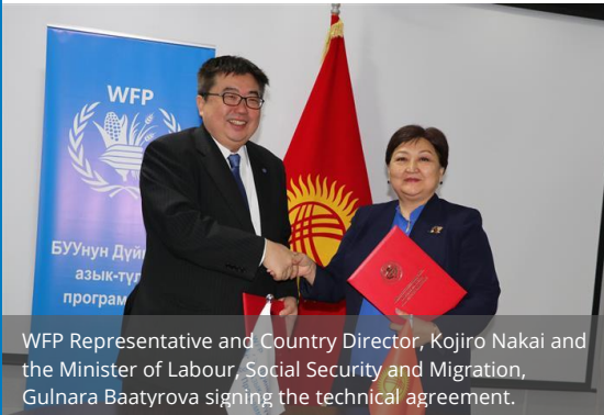
WFP Representative and Country Director, Kojiro Nakai and the Minister of Labour, Social Security and Migration, Gulnara Baatyrova signing the technical agreement.