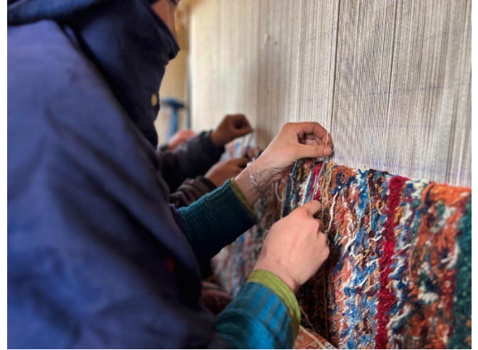
WFP's vocational training programme on tailoring and carpet weaving, Bamyan, Afghanistan.