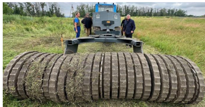
The first Ukrainian-made certified roller system is being used for technical surveys in Kharkiv oblast in June 2023.

FSD is also working on augmenting its capacity for technical surveys to expand land release activities, by engaging locally manufactured equipment solutions. By the beginning of August, the first Ukrainian-made roller system, built in Kharkiv, was certified for use. The project is currently in the process of procuring three of them.