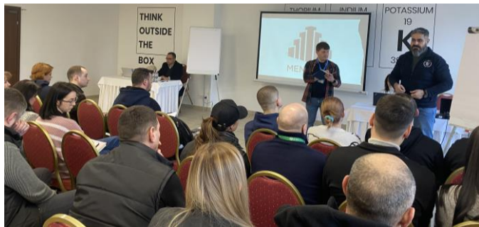
Cooperating Partners and field-based WFP staff attend the partner training in the eastern city of Dnipro on 22 February.