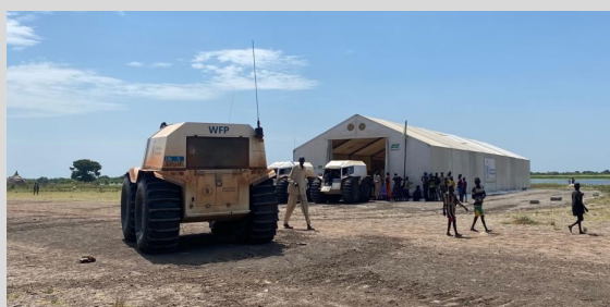
Photo: Offloading SHERPs at the warehouse in Guit Town