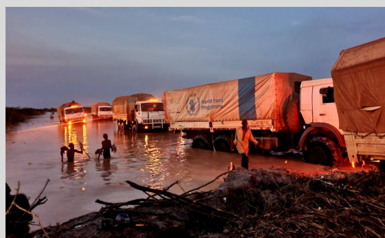
Photo: The first fleet trucks crossing the dyke to enter Bentiu

To date, 43,986 people have received food assistance in Rubkona and Guit counties. WFP continues to bring food in order to scale up the response.