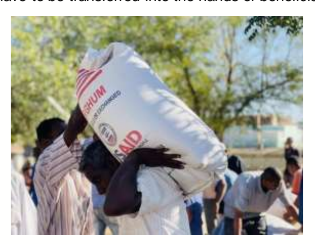
© First food distributions in Wad Madani in over a year. WFP was the first agency on ground delivering humanitarian aid, once access to the key eastern city opened up. WFP Partners. 27 January 2025