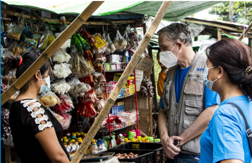
Photo: WFP Myanmar Country Director visited local vendors in Dala Township, Yangon peri-urban areas.