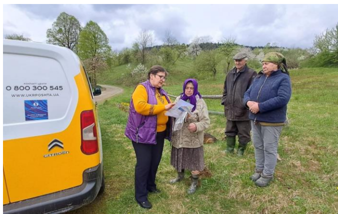
Photo caption and credits: An elderly woman living with disability since childhood is provided with cash assistance through Ukrposhta in a remote village, Yasenytsia of Lviv region on 17 April.

Between 17 and 19 April, as part of its monitoring missions, WFP visited Ivano-Frankivsk, Lviv and Zakarpattia regions. Here WFP is hand-delivering cash to vulnerable people through Ukrposhta, a Ukrainian postal service. These beneficiaries live in hard-to-reach mountainous areas, and do not have bank accounts, under the complementary social benefits programme. People with disabilities since childhood, and children with disabilities are included under the programme, according to the February Resolution of the Cabinet of ministers of Ukraine.