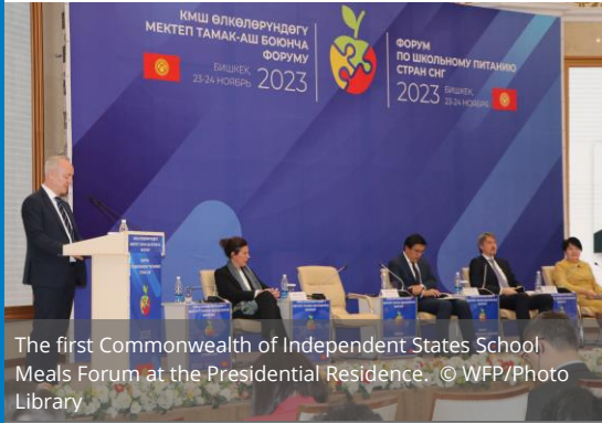
The first Commonwealth of Independent States School Meals Forum at the Presidential Residence.