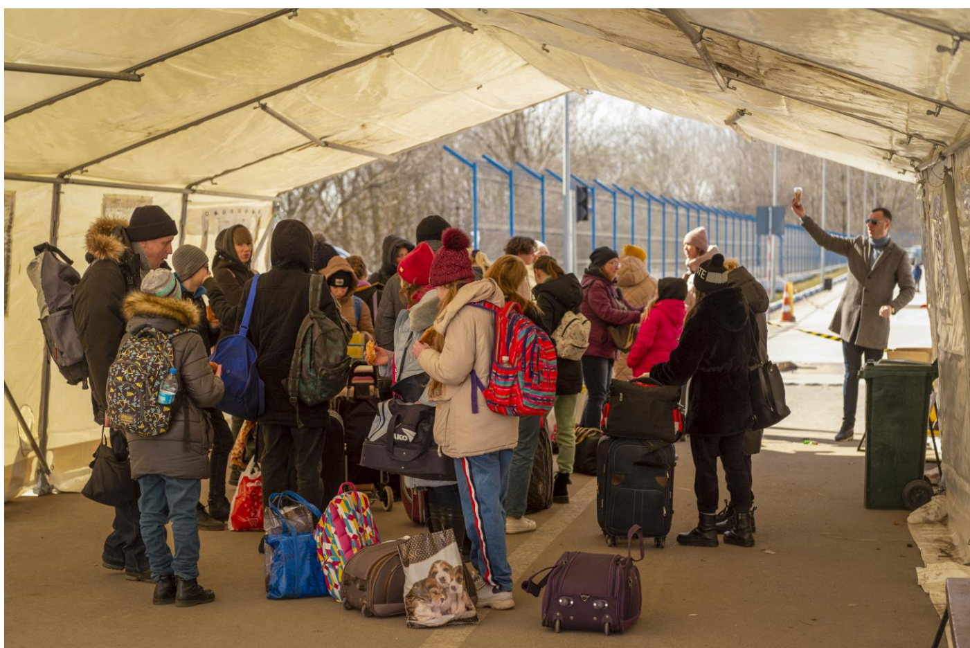
Photo Caption: People fleeing the conflict in Ukraine waiting to cross the Ukraine-Moldova border checkpoint near the town of Palanca

A Telecommunications Specialist from WFP's Fast IT & Telecommunications Support Team (FITTEST) is currently in Lviv to conduct further assessments in preparation for the establishment of interagency security communications in the city. Throughout a week-long mission, an assessment of the ICT and security communications needs will also be conducted in Vinnytsia.