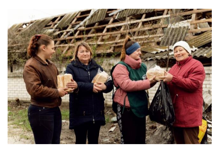
In the heavily damaged town of Izium, Kharkiv oblast, the war-affected people are happy to receive bread from WFP in partnership with ADRA.

In the town of Izium in Kharkiv oblast, as soon as the area became accessible as of 11 September, WFP started distributing bread within one week.