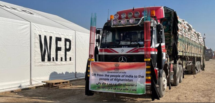
The first batch of Indian wheat arrives at WFP warehouse in Jalalabad.