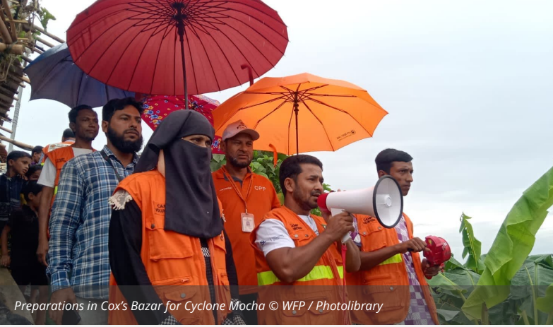
Preparations in Cox's Bazar for Cyclone Mocha