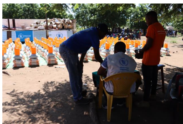
Distributions of 30-day rations in Doa district, Tete province.