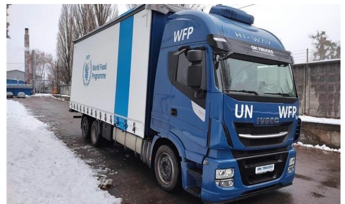
One of the four newly arrived second-hand trucks, will further facilitate flexibility required for timely assistance.

Among the eight new and four second-hand trucks procured to support Odesa and Dnipro Field Offices, the four second-hand trucks arrived in Ukraine this week. Currently under maintenance, the first truck is expected to be operational starting next week. The additional fleet will provide increased flexibility and consistency needed to increase dispatches to the hard-to-reach and newly accessible areas, not only for WFP Ukraine's food assistance but also for the interagency humanitarian convoys facilitated by the Logistics Cluster.