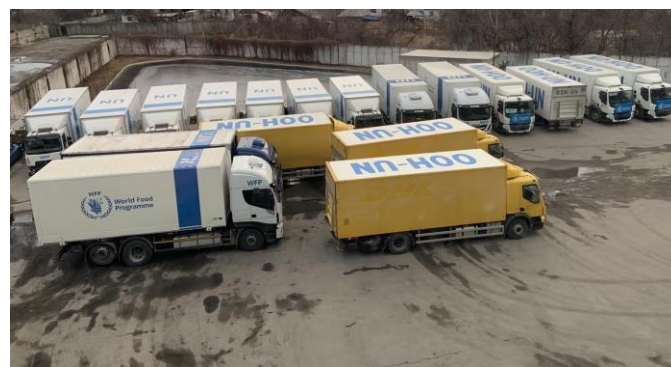
11 newly procured WFP owned trucks arrived in Dnipro on 15 February, are expected to increase delivery capacity for timely assistance.

Seven new Renault and four Iveco trucks departed from Kyiv on 14 February and arrived in Dnipro warehouses on the following day, bringing our total dedicated fleet to 21. In addition, one more truck is expected to become operational by the end of this week. Trucks will support regular WFP food deliveries as well as interagency convoys coordinated by the Logistics Cluster.