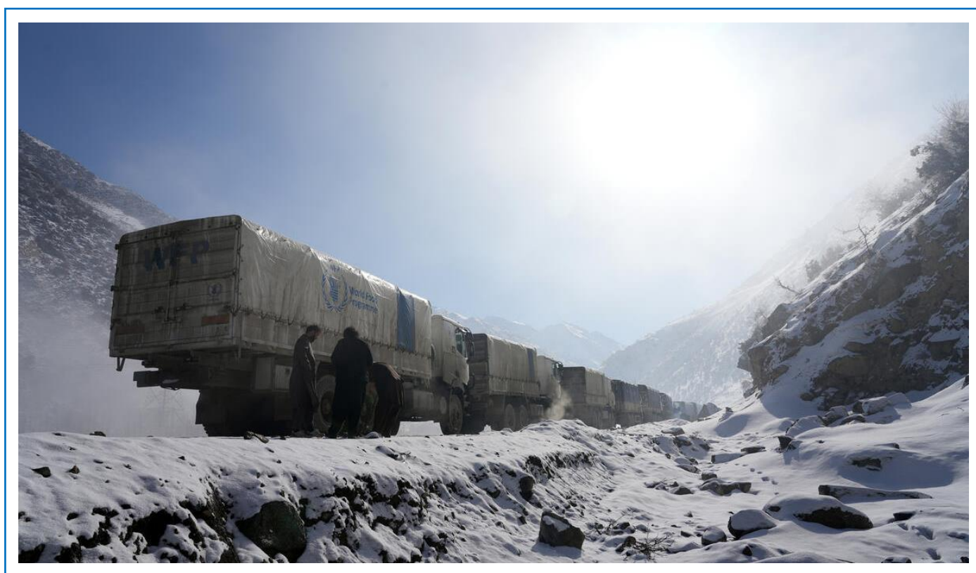
WFP fleet trucks on the road to the Salang Pass.

* Monthly distribution figures are estimates and subject to change pending final beneficiary reconciliation.