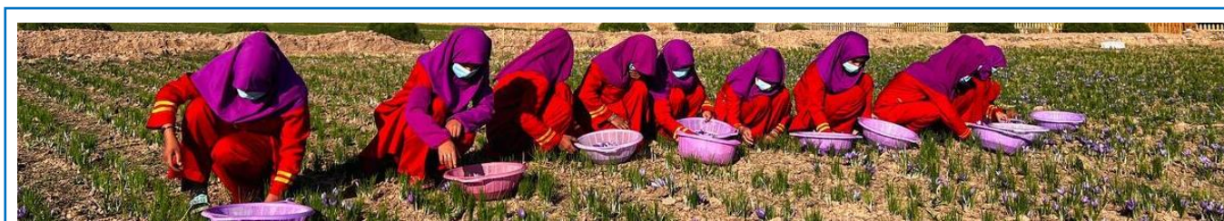
A group of women working on the saffron fields in Herat, Afghanistan.