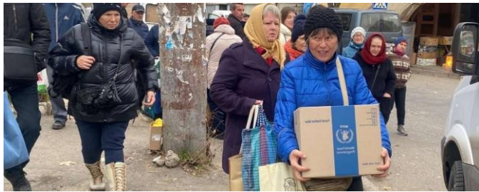
A resident of Kherson smiles as she receives food assistance on 13 November. The city became accessible on 11 November.

Towns in Kherson oblast and the surrounding areas in Mykolaiv oblast started to become accessible from 9 November after 8 months, then on 11 November, Kherson, a city of more than 280,000 people also became accessible. As a result, an immediate need to assist over 160,000 people in those areas has been registered through relevant authorities. In less than 72 hours, WFP and its partners assisted 6,048 people in the city with rapid response food rations on 13 November.